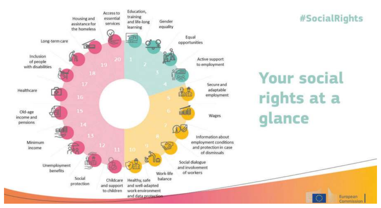
Figure 1. The European Pillar of Social Rights in 20 principles

The Sharing Innovation in Social Inclusion partnership (SISI) was conceived in the framework of the EU policies for social inclusion and most particularly of the European Pillar of Social Rights (Social Pillar). This declaration adopted by the EU in 2018 sets 20 principles and rights which are at the base of the promotion of decent living and working conditions. It represents the EU's response to the social challenges outlined in 34 (SDGs), which paved the way for relevant policies favouring the improvement of individuals' living and economies in a perspective which is more considerate of natural resources, environment, wellbeing and social inclusion.